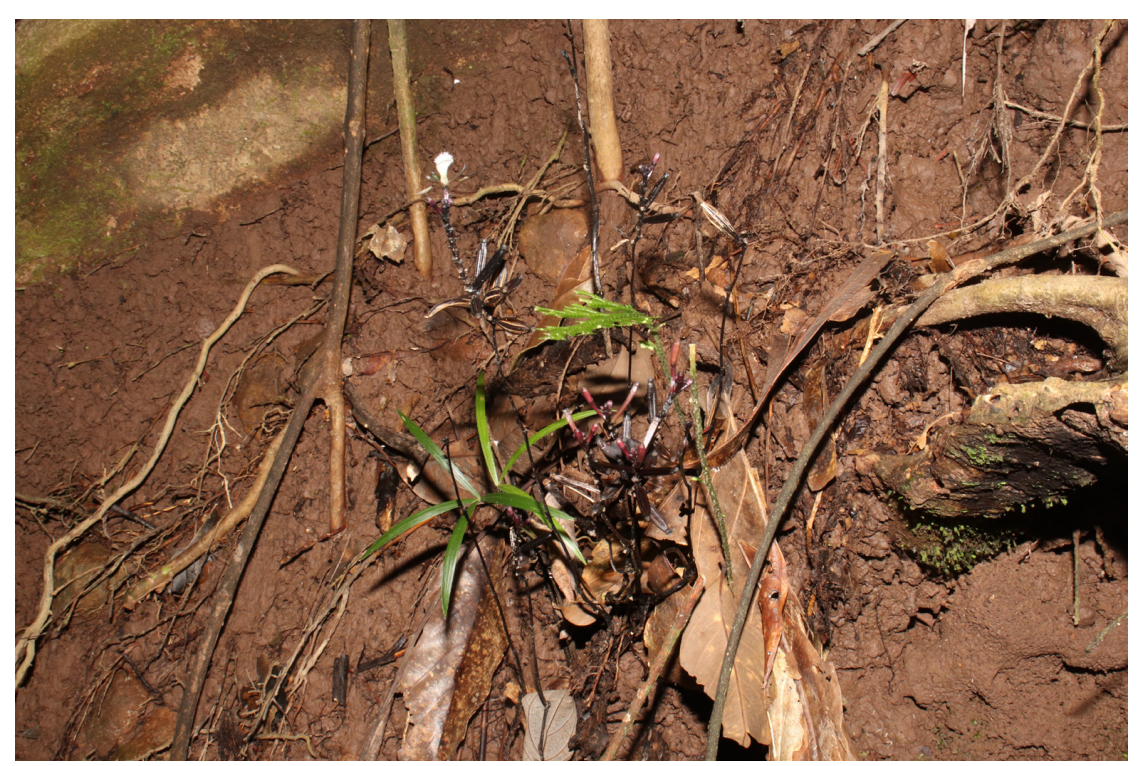
FIGURE 2. In situ photograph of Lecanorchis multiflora showing its habit and habitat.

poaching (Tanalgo 2017). Furthermore, although it is widespread across tropical Asia, the species was found to be quite rare, with less than ten mature individuals found in MTPL. Therefore, following the Red List Criteria of the IUCN Standards and Petitions Subcommittee (IUCN 2019), we proposed this species to be treated as 'Endangered'.