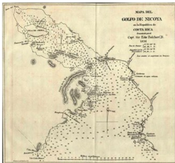
Figure 2. Chart of the Gulf Nicoya (1838).

In Table 2, note that the surveys for the earlier charts carried out by Belcher mostly concentrate on Costa Rica, Panama, and Mexico. The later ones by Kellet deal mostly with Colombia and Panama, thus completing the Royal Navy's main surveying work in the region. One of the earliest rectifications of erroneous information contained in the Bauza chart of 1822 concerned the Gulf of Nicoya and was produced by the surveys of HMS Sulphur in 1838. In this chart, reproduced as Figure 2, the surveys provided the proper layout of the gulf, and these were used in drawing the chart. The figure depicts the numerous soundings taken inside the gulf and among the islands, as well as the anchorage at Puntarenas and certain astronomically determined positions. It is interesting to note that the outline of this gulf prior to Belcher's chart had been accurately depicted three hundred years earlier in 1529 in a map by Gonzalo Fernandez de Oviedo, who participated in the first explorations along the coast of Central America by the Spaniards. This information however, was lost in the Spanish archives for centuries.