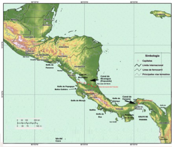
Map 1. The Central American Isthmus and proposed sites for the canals in Nicaragua and Panama

The expansion of the United States to California and the gold rush that followed provided great challenges to Central America, as the westward migration resulted in a sudden need to greatly improve trans-isthmian communications, and the rise in world trade made the isthmus an area of geopolitical interest to the major sea powers. In the early 1850s, a railroad across Panama and a steamboat route across Nicaragua temporarily addressed these needs, but it became increasingly clear that a canal through the isthmus was the solution to the transport required by world trade, and that it was only a question of time and opportunity before such a canal was built.