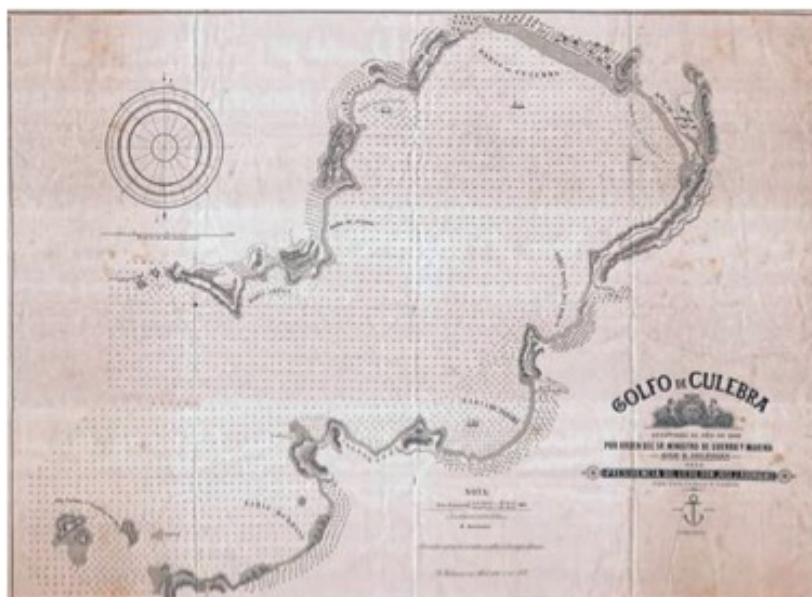
Figure 4. The Bay of Culebra, Fradin 1892.

In spite of the mentioned survey work carried out in the 1890s and early 1900s, this was discontinued as a direct consequence of the small national naval force being disbanded in 1907. As a consequence, the technical gains obtained were forgotten over time and the improved understanding of nautical affairs that resulted from these was lost. However as indicated above, in some cases sufficient knowledge remained of these important maritime sites and this was used to defend the national interest, ensuring that these were not taken over by other countries. In the long run, all those geographical sites have contributed significantly to Costa Rica's economic development and to the conservation of natural resources of global importance.